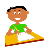
Writing/ Language Center