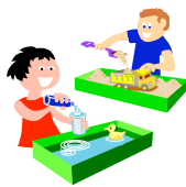
Sand and Water Center