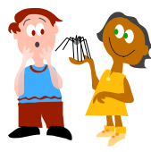
Science/ Discovery Center